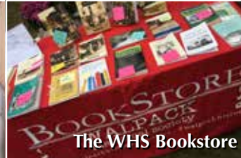
The WHS Bookstore