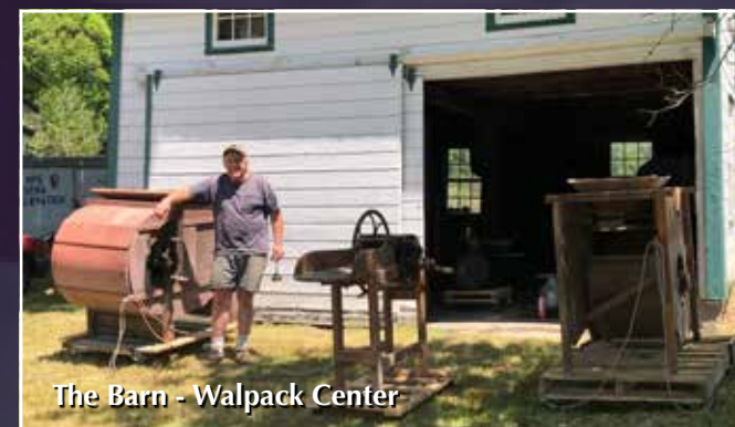
The Barn - Walpack Center

Walpack Center events include tours of the Rosenkrans Museum, Walpack Church and demonstrations of early farm equipment at the Barn. Books will be available for sale at the museum.